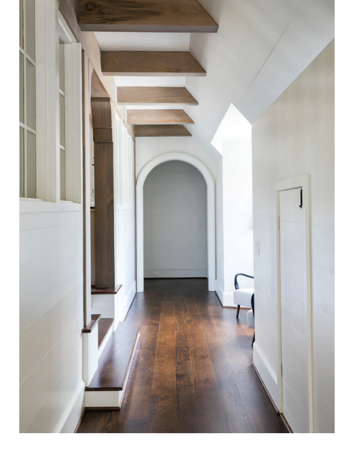
Above An angled dormer visible from the front illuminates the attic hallway. Steps lead to the second-story River Room where the family gathers and entertains. Below With a pecky-cypress ceiling and windows overlooking river and trees, the great room or River Room is comfortably furnished for informal gatherings.