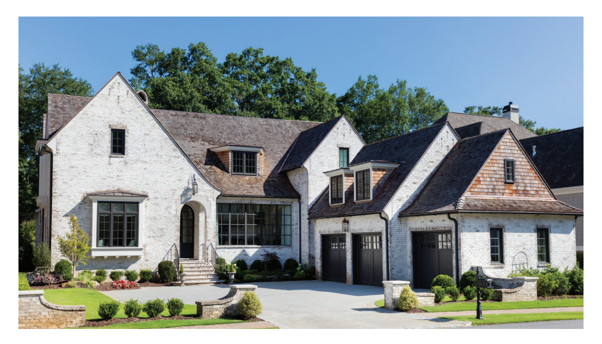
Above Perpendicular to the house and tucked away, a garage wing creates a cozy front court. The house's oversized bricks have been lime-washed. Opposite The formal dining room is awash in natural light from the bank of steel windows that overlook the arrival court at the front of the house.